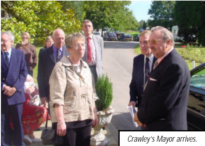
Crawley's Mayor arrives.